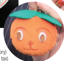
Kakki-kun (accessory) 500 yen (including tax)