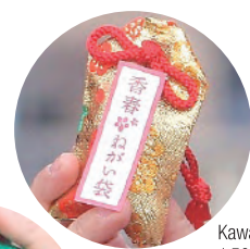
Kawara Good Luck Charm 1,500 yen (including tax)