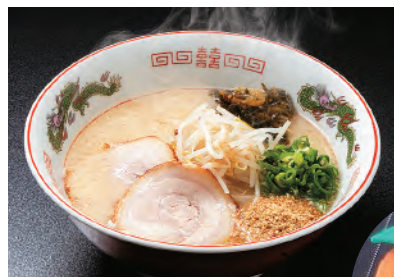
Yamagoya Ramen ☎0947-47-2525